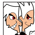
The Dis Guys